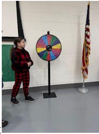
Monday Morning Meeting